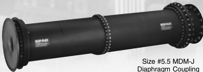
Size #5.5 MDM-J Diaphragm Coupling