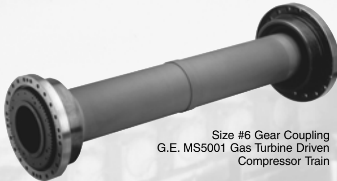
Size #6 Gear Coupling G.E. MS5001 Gas Turbine Driven Compressor Train