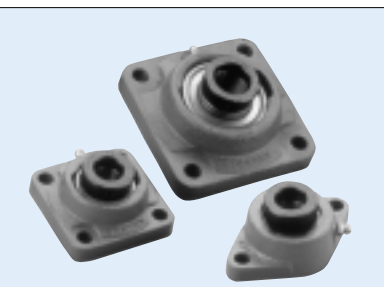
Fig 1.10, Cast Iron Flange Bearings