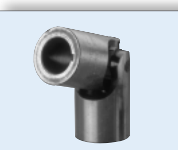
Fig 1.31, "J"and "JS" Series Machine-Finished Universal Joints

So let's get started, beginning with the most basic of gears: the spur gear.