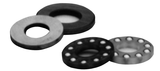
Fig 1.6, Thrust Bearing