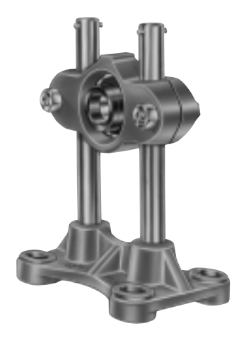
Fig 1.11, Adjustable Shaft Support