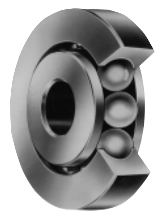
Fig 1.5, Radial Bearing

A flanged cartridge consists of a ball or roller bearing with spherical outside diameter mounted in a cast iron housing. The spherical shape of the bearing's outside diameter will accommodate some degree of shaft misalignment. They, too, are often referred to as "self-aligning". (See Figure 1.10)