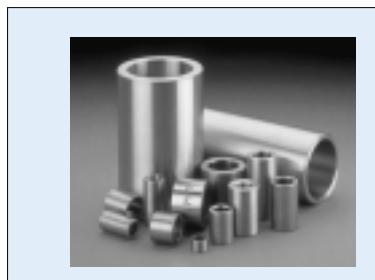
Fig 1.1 Bear-N-Bronz Plain Cylindrical Bearings