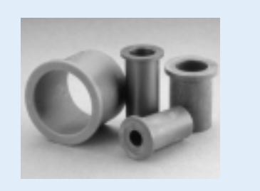
Fig 1.3 Bost-Bronz Flanged Bearings

Boston Gear sells two types of plain bearings : Bear-N-Bronz , made from a cast, solid bronze material, and Bost-Bronz , made from a porous bronze, oil impregnated type of bearing material. Bear-N-Bronz bearings are available as plain bearings, cored bars or solid bars. Bost-Bronz bearings are available as plain bearings (also known as sleeve bearings), flanged bearings, thrust-bearings, cored bars, solid bars and plate stock. ( See Figures 1.1, 1.2, 1.3 )