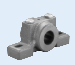
Fig 1.7, Split Cast Iron Pillow Block (no bearing)